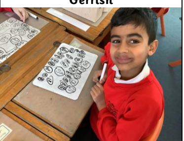
Making the same amount