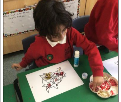
Creating dragons for Chinese New Year