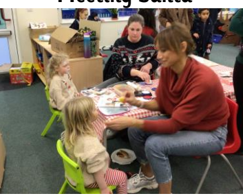
Christmas face painting!