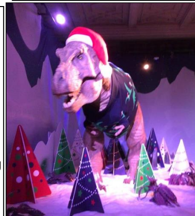
Natural History Museum