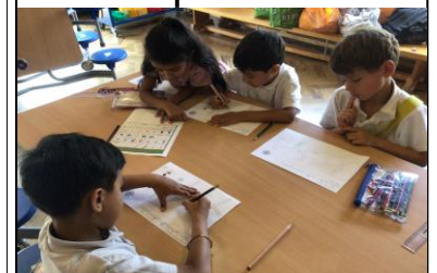
Map work in KS1