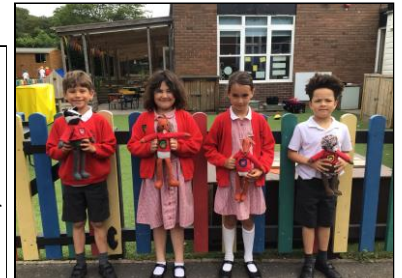
House Captains Summer 2