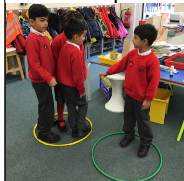
Parts of a whole