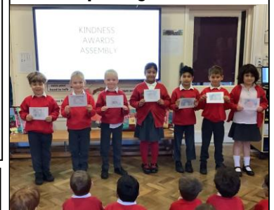
Kindness Awards Winners