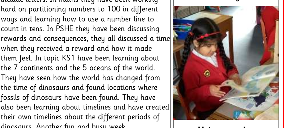
Using an atlas